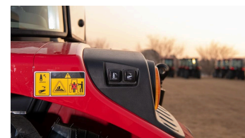
6. External hitch control buttons