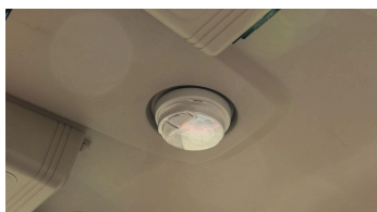
4. LED interior lighting