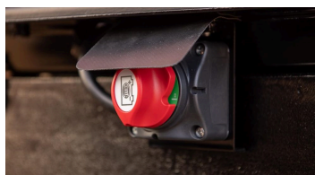
2. Battery shut-off switch