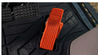
3. Electronic organ-type pedal