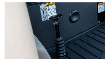
5. Differential lock system