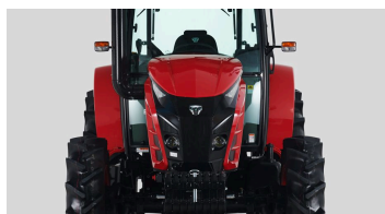
1. Tiger face front fascia