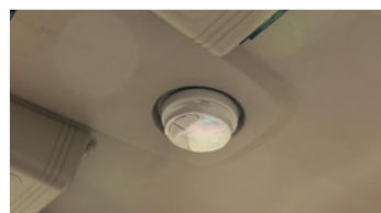
4. LED interior lighting