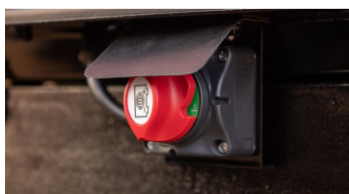
2. Battery shut-off switch