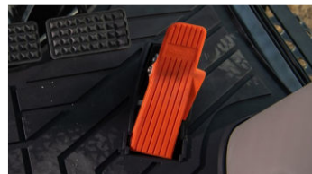
3. Electronic organ-type pedal