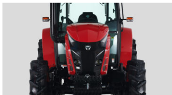
1. Tiger face front fascia