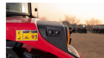
5. Differential lock system