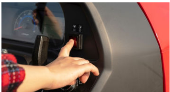
2. PTO on/off switch