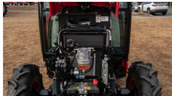
3. Dual filter air cleaner