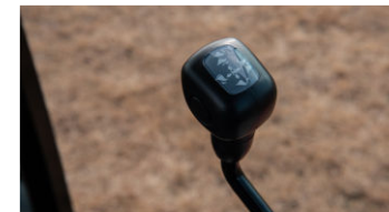
6. Joystick control for front-end loader