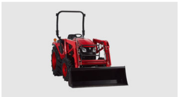
1. Optional loader with high lift capacity