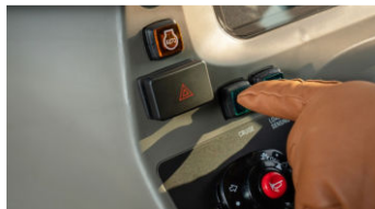
4. Cruise control