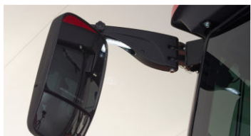
2. Side view mirrors