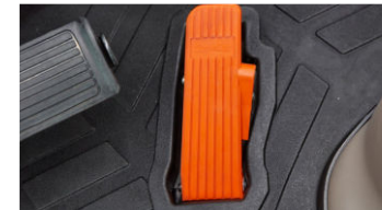
5. Organ type pedal