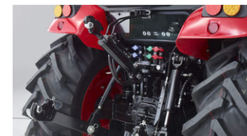
6. Hydraulic top link