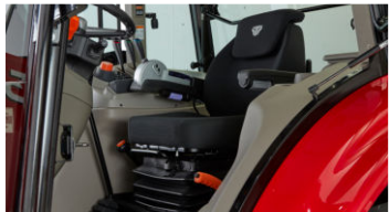
1. Air-ride full suspension seat