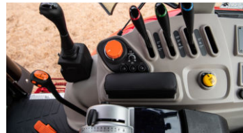
3. Ergonomic operational control center