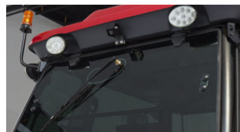
4. Rear view camera