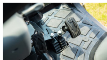
4. Highly responsive forward & reverse HST (T4048 (5025CH))