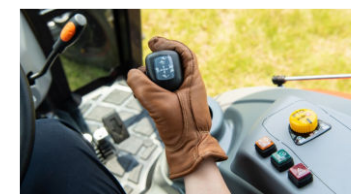
6. Joystick control for front-end loader