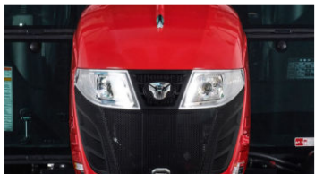
1. Hood design