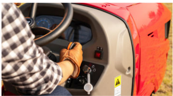
1. Auto throttle