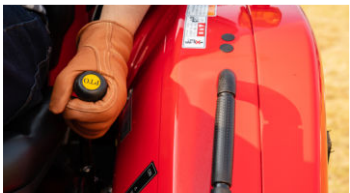
2. Auto PTO lever