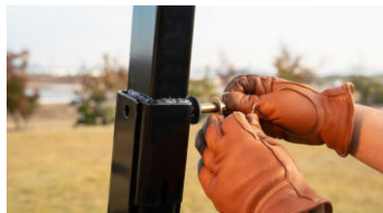
4. Foldable ROPS