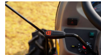
6. Shuttle transmission