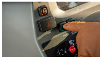
3. Cruise control