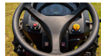
6. High visibility instrumental panel