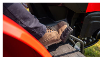
4. Responsive forward/reverse HST