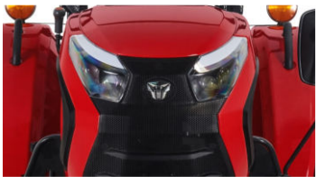
1. New iconic hood