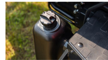
5. High-capacity fuel tank