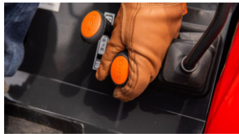
3. Ergonomic lever