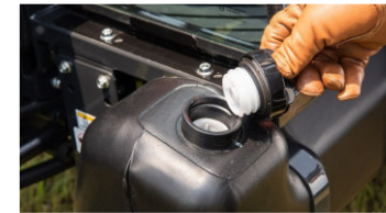
5. High-capacity fuel tank