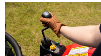
6. Joystick control for front-end loader