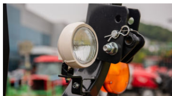
4. Rear work light