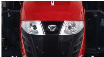
1. Hood design